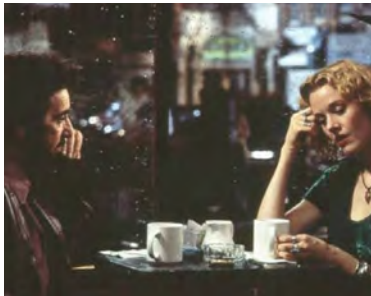
Le Figaro Cafe Famously featured in film "Carlitto's Way" with Al Pacino and Penelope Ann Miller