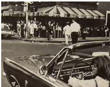
Once frequented by Jack Kerouac, Lenny Bruce and Bob Dylan